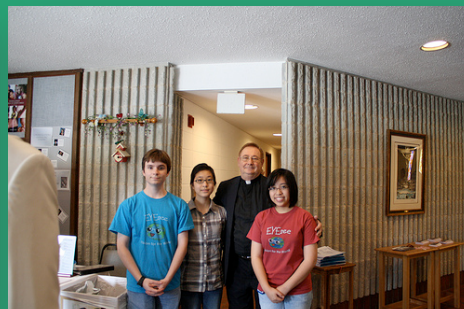
St. Julian Eymard Parish