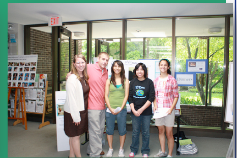
Northwestern University Sheil Center