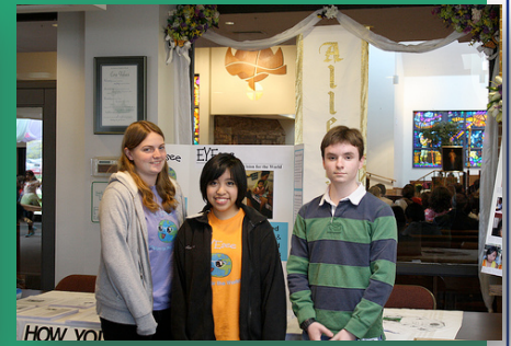
St. Isidore Parish