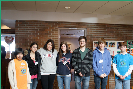
Church of the Holy Ghost