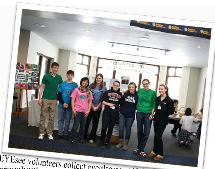
EYEsee volunteers collect eyeglasses at Holy Family Parish.

Student councils of St. Emily Catholic School (Mt. Prospect), St. James Catholic School (Arlington Heights) and St. Thomas of Villanova Catholic School