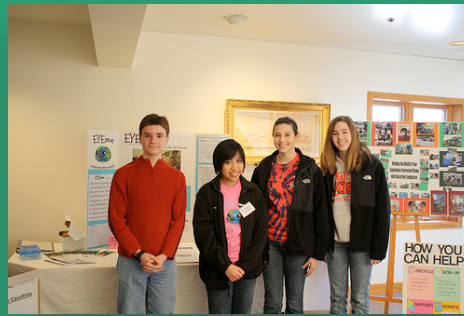
Prince of Peace Parish