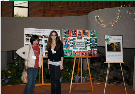
St. Marcelline Parish