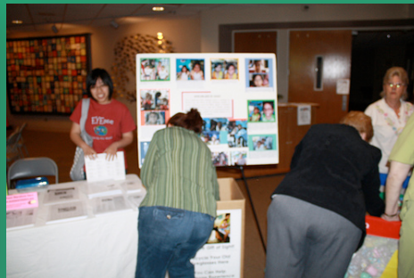
St. Ansgar Parish