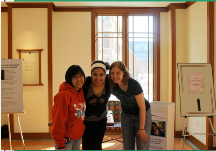
The Garlands of Barrington