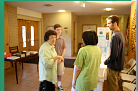
St. Colette Parish