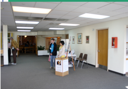
St. Zachary Parish