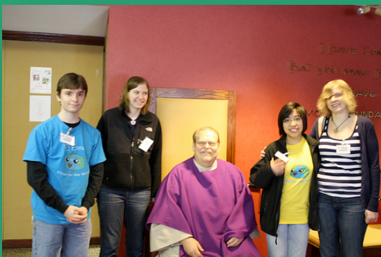
Our Lady of Hope Parish