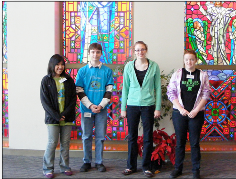
Our Lady of Ransom