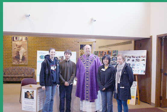
St. Francis de Sales Parish